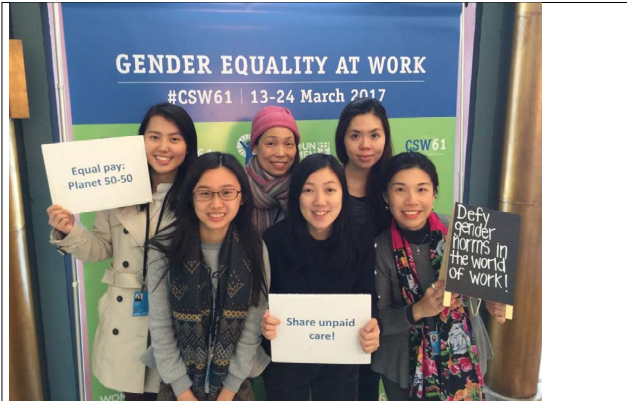
We attended the United Nations Commission on Status of Women in New York to know more on gender equality. (I am in the front row on the right)