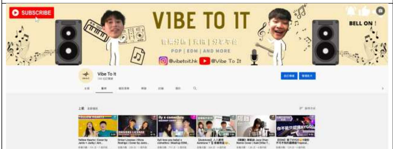
This is the Youtube channel that I've created to share music. I'm at the right hand side of the banner.